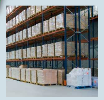
No special hygienic requirements are placed on the components used in storage and packaging

In this zone, the products are generally already packaged and no longer exposed to direct contact with system components. In this case, the requirements are comparable with those in the classic industrial environment. Cleaning the packaging systems does not require any aggressive cleaning agents and is generally not done with high-pressure equipment. Our standard program for sensor/actuator cabling is suitable for use in this zone.