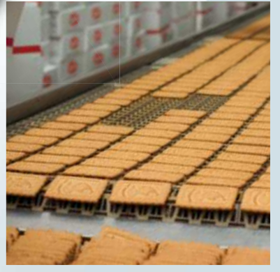
Conveyor belt in the spray zone

In the spray zone, components can come into contact with food. In contrast to the product contact zone, the food does not return back to the process after contact with the components. The plug-in connectors offered by Phoenix Contact in washdown design were specifically developed for the spray zone application. Smooth contours at the grip minimize the adhesion of food particles at the plug-in connector.